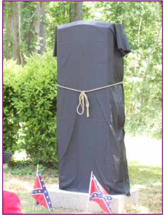
The Monument Shrouded