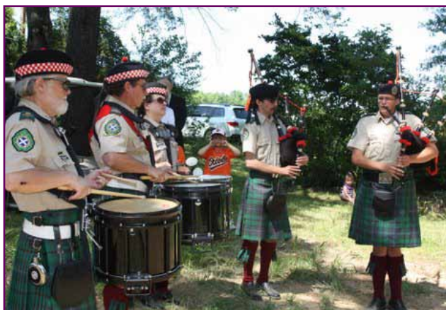
St. Andrews Legion Pipes & Drums