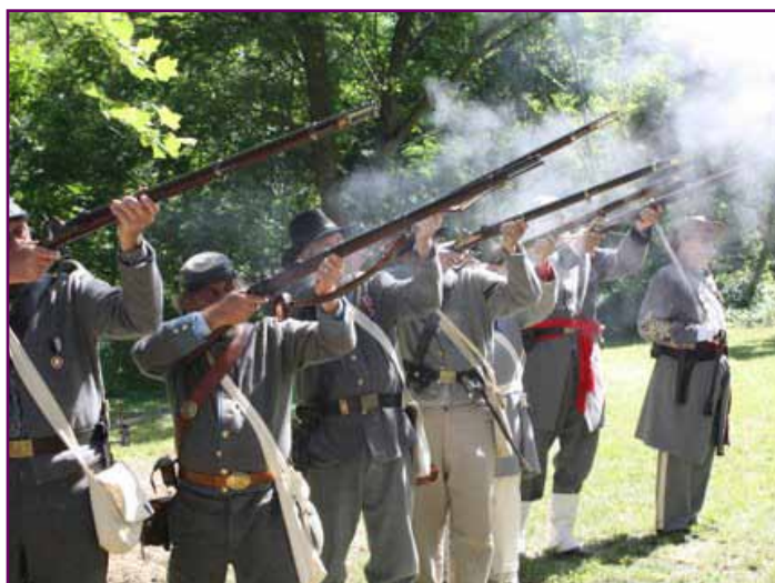
21-Gun Musket Salute