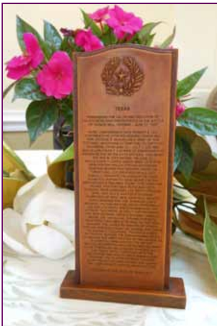
The Gaines' Mill Monument Miniature