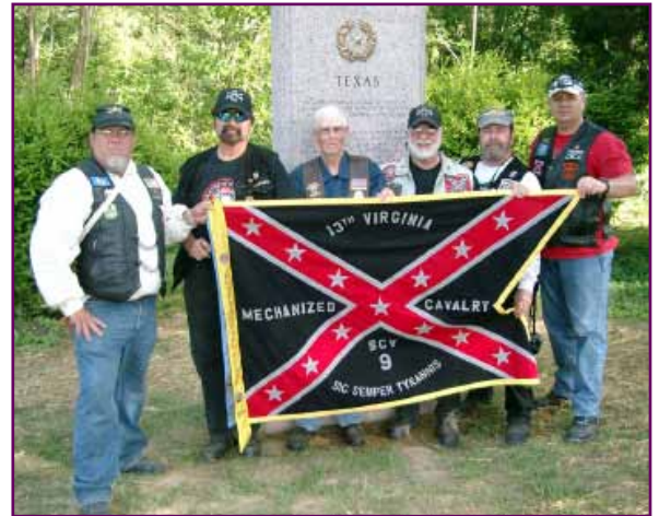
13th Virginia Mechanized Cavalry, VA SCV Camp 9